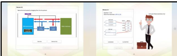
Figure 2 Interactive recalling and instant gratification

A number of video demonstrating microprocessor applications based projects have been included in the ibook as shown in Figure 3 and Figure 4. This enables students to explore what is a microprocessor and what is it used for in their daily life and thus increasing their interest in this topic.