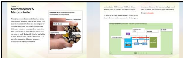
Figure 1 Explaining the technology

In this work, an iBook has been developed for teaching and learning in Microprocessor Technology subject. We achieve better interactive with students compared to the content of traditional, printed books that is confined to text and static image as shown in Figure 1. The developed microprocessor technology iBook is able to display stunning images in full screen which students can interact with using gestures they are familiar with like pinch to zoom. Inclusion of galleries and interactive exercises reduce boringness in traditional printed book and achieve better understanding to the topic of discuss as shown in Figure 2. Students is able to identify any misconceptions or gaps in their knowledge through instant feedback from answering interactive questions.