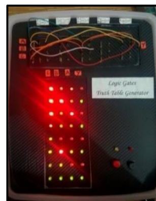
Figure 1 Hardware layout.

The proposed educational kit has a size of 50 cm of length, 30 cm of width and 15 cm of height. The material used in PVC plastic because it's durable yet light with weight only around 500 gm. Then, the cost of the proposed educational kit is estimated at less than RM150, where, there is an affordable price for the secondary school students. Figure 1 illustrates the physical layout of the proposed kit. The top part of the educational kit is the area where the student will do the wiring required for the combinatorial logic circuit required. The bottom area is where a matrix of Red-Green Light Emitted Diodes (RG LEDs) which used to represent the truth table.