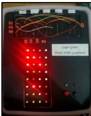
Figure 4 Educational kit connection.